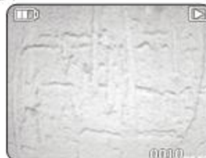
TV Video& Audio Playback_Photo

> Manually play:by pressing 'up button ⊕' or 'down button ⊖' for browsing, when video camera icon appears on the top right corner, it indicates the file is video, press "confirm button ⊙" to play the video.Please set the TV volume in order to get proper sound effect.