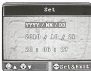
Time setting Step3