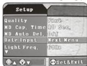
Time setting Step1

> After finish setting, long press "confirm button" save and quit the setting.