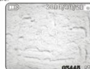
Motion-detect photo-taking standby

> Motion detect loop recording:when TF card is full ,the camera will delete old video or photo to get new space recording new videos or photos.If turn off loop recording fuction,the camera will turn off automatically when there is no enough space to record.