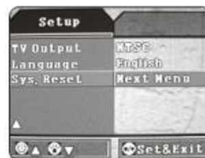
System reset step2