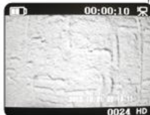
TV Video& Audio Playback_Video