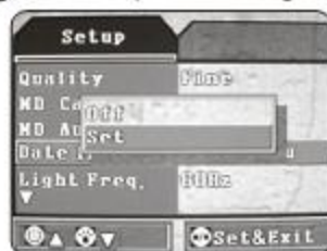
Time setting Step2