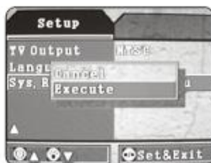
System reset step1

Illuminate: If you want to reset the system, choose "Execute", and short press "confirm button".